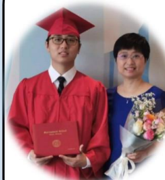
Graduated from China