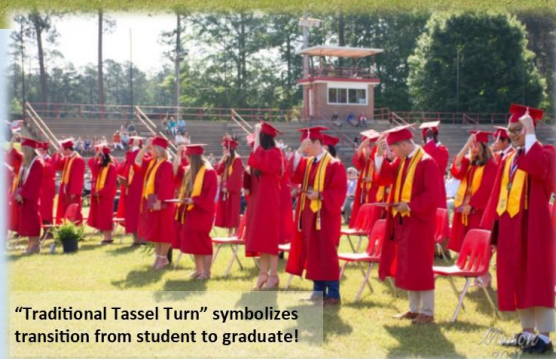
"Traditional Tassel Turn" symbolizes transition from student to graduate!

In this issue we highlight the Springwood high school graduates who showed inspiration, determination and the confidence to get through this year and to look towards their futures! Despite 2020 – 2021 being a challenging year, Springwood students had the opportunity for in-person learning, competitive sports, club activities, and recognition ceremonies. At Springwood, we are confident that our students are well prepared to find success next year at universities throughout the United States.